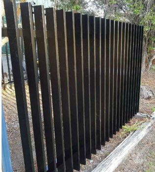
4. MONUMENT COLOUR VERTICAL BATTENS