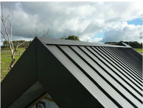
1. MONUMENT COLORBOND KLIP LOK ROOF SHEETING