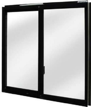
3. MONUMENT POWDER COAT ALUMINIUM WINDOWS & DOORS